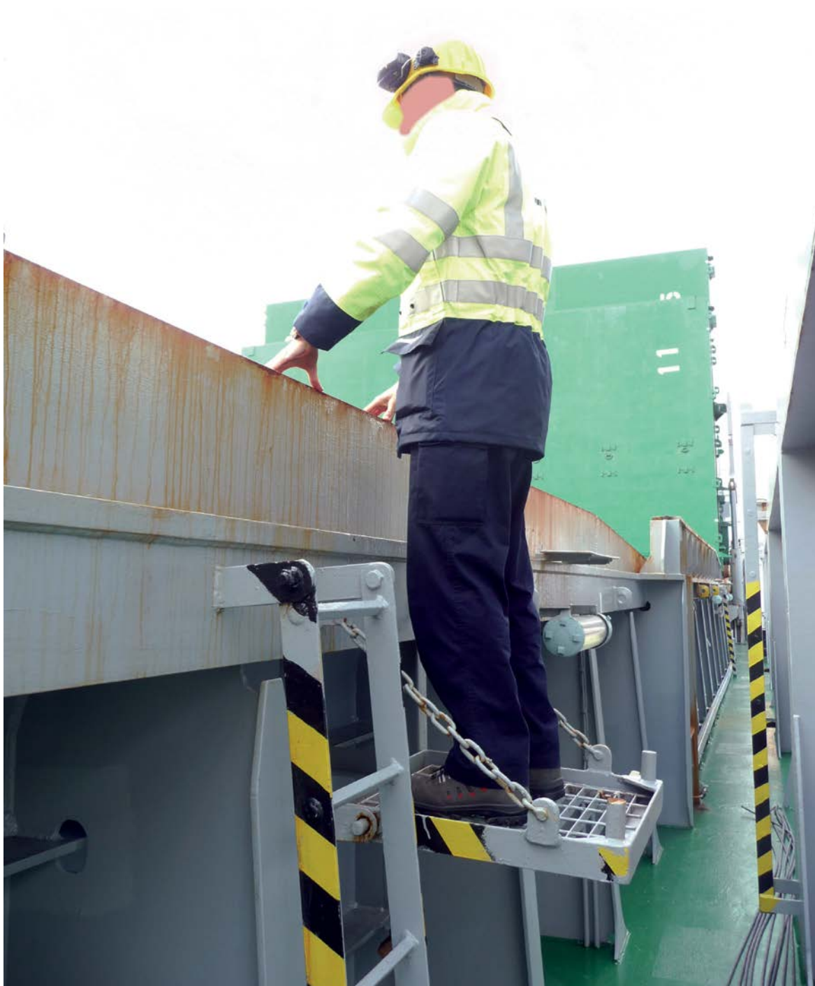
Figure 5: Reconstruction of the position on the stevedore platform. No fall protection had been installed. The platform is located on the aft side of the forward hold.

The Azoresborg uses what is known as stevedore platforms to supervise loading and unloading operations from the side opposite to where the ship is being loaded or unloaded (see figure 5). The crew can reach the fold-out platform with a fixed ladder. The platforms contain supports on which detachable fall protection can be installed. None of the platforms had (recently) been equipped with fall protection. This is evident from the fact that none of the platforms, particularly the supports, showed any paint damage. This type of damage inevitably occurs when installing fall protection.