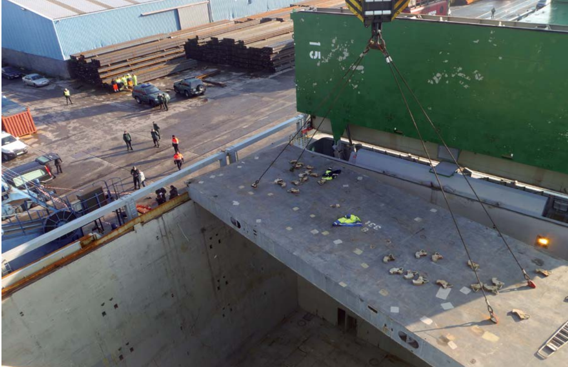
Figure 4: The pontoon used as a work platform.

Consoles are usually installed on board the Azoresborg and its sister vessels using a pontoon as a work platform. After placing the consoles that are to be installed on the pontoon, the crew then position themselves between the four hoisting cables, to which they secure themselves with a safety harness (see figure 4).