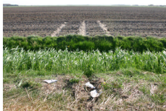
Photographs 1-4: D-ERPW after the accident