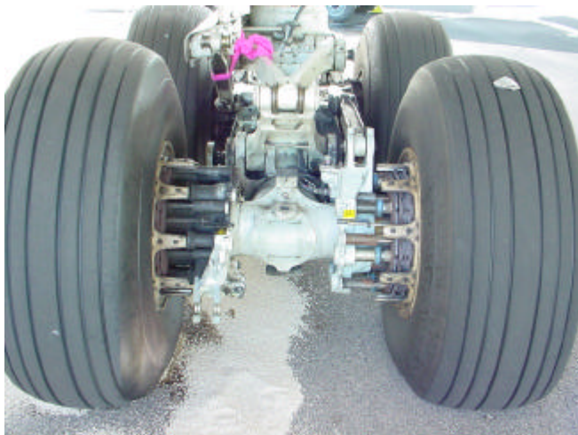
The broken lug (bottom left) of the right MLG

One witness stated that during the acceleration phase of the take-off he had noticed a blowpipe flame from the exhaust cone of engine #1 twice, followed by a bang. Another witness noticed one blowpipe flame during the acceleration phase and two white plumes of smoke originating from the tires after the take-off had been rejected. When the aircraft taxied from the runway air traffic control instructed the flight crew to hold the aircraft because of smoke development and some flames near the right main landing gear (MLG). The crew stopped the aircraft and the engines were shut down. The airport fire fighting services were on standby to keep the situation under control. No crew members or passengers got injured.