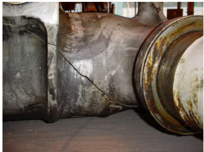
The crack in the right MLG bogie beam